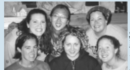
International Wolf Center

For more information about Wolf Educator Internships, check out www.wolf.org .