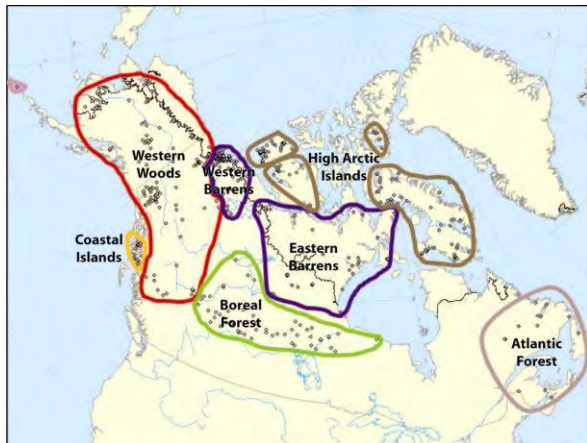
Fig. 1. Genetic clusters in North American wolves and their correspondence to habitats (from Carmichael et al. 2007).

A large body of recent discussion focuses on defining evolutionary units below the species levels based on statistically supported differences in allele and haplotype frequencies among