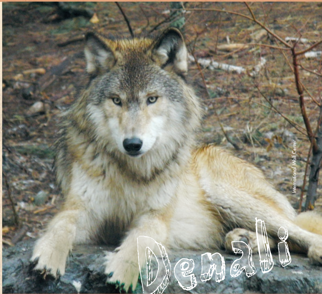
International Wolf Center

Denali is the largest member of the International Wolf Center's Exhibit Pack. Many visitors mistakenly assume Denali is the dominant member of the pack due to his size. Denali weighs approximately 138 pounds (63 kilograms) and is taller than his brother Aidan. Despite Denali's larger size, he remains submissive to Aidan in rank order. Denali has a playful nature. He often runs and plays with Boltz and Luna, the yearling members of the Exhibit Pack. ■