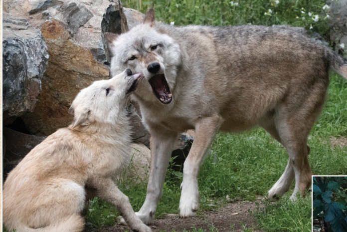
Axel is food begging from Aidan.