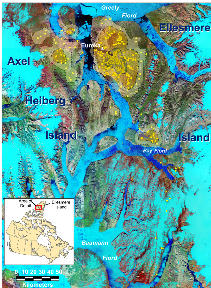
Figure 1. Ellesmere Island, Nunavut, Canada and vicinity with 554 locations of a pack of \geq 20 wolves. This pack was monitored by a global-positioning system radio collar 9 July 2009 through 12 April 2010. The dotted line is the 99% probability contour, the dashed line is the 95% contour, and the solid line, the 60% probability. doi:10.1371/journal.pone.0025328.g001

The GPS collar recorded the collared wolf's locations at 6:00 a.m. and 6:00 p.m. daily from 9 July 2009 through 12 April 2010,